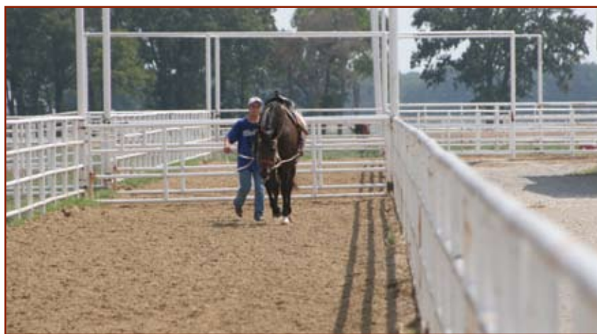
A SYSTEM OF SWINGING GATES HELPS TO PREVENT HORSES FROM BUILDING UP A HEAD OF STEAM SHOULD THEY GET LOOSE BETWEEN THE BARN AND THE TRAINING TRACK.

But horses won’t learn to run fast from a donkey, so they are put through the